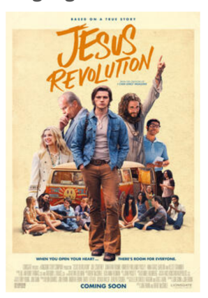
Based on a true story, starring Kelsey Grammer

'Jesus Revolution' review: Emotionally powerful film highlights how God uses broken people to bring revival