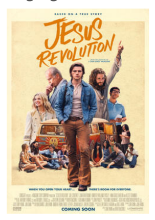
Based on a true story, starring Kelsey Grammer

'Jesus Revolution' review: Emotionally powerful film highlights how God uses broken people to bring revival